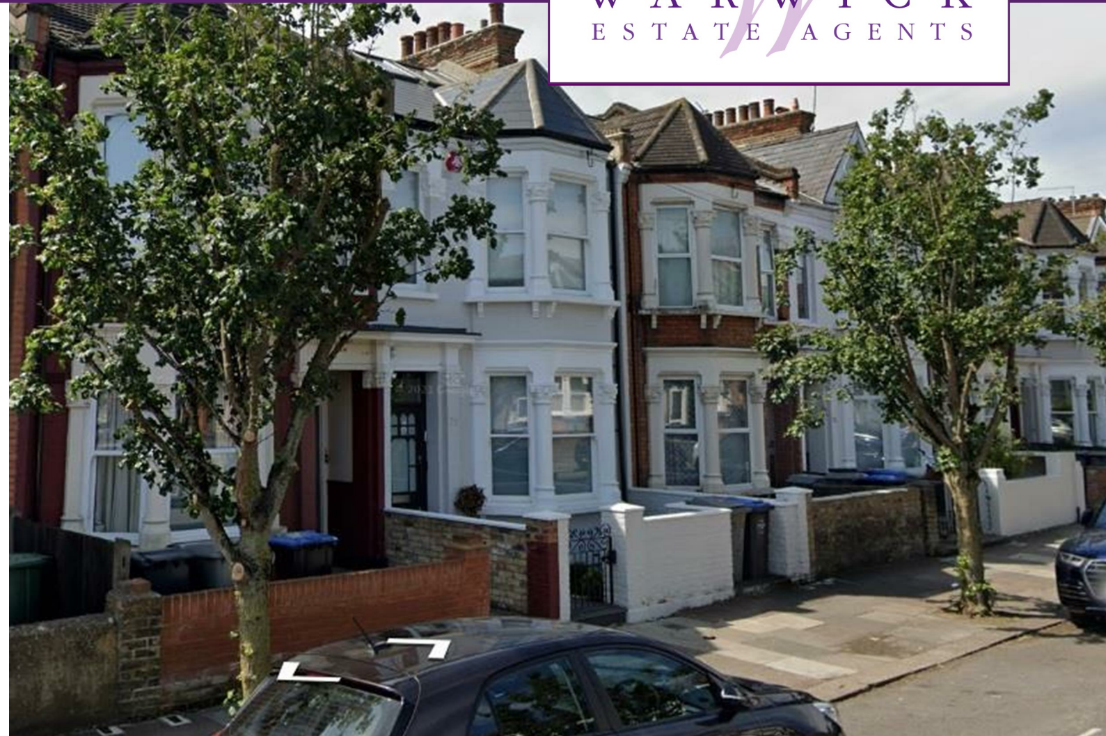
Buchanan Gardens, Kensal Rise, NW10 5AA